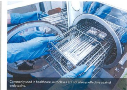
Commonly used in healthcare, autoclaves are not always effective against endotoxins.